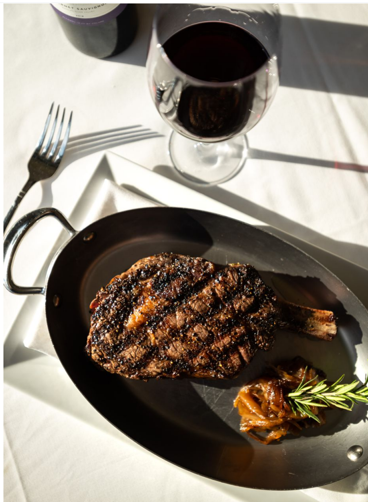
Davio's is a Northern Italian steakhouse that seems right for a special evening with your sweetheart.